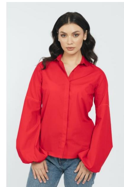
RED BLOUSE WITH PUFFY SLEEVES