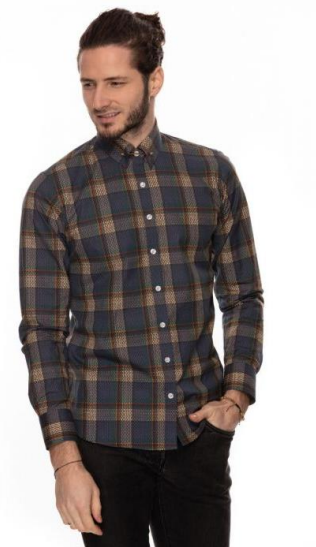
SLIM FIT, PRINTED SHIRT WITH COLLAR PIN