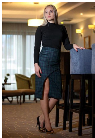
BLUE AND GREEN CHECKED PENCIL SKIRT