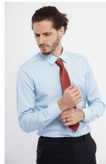
BLUE BAMBOO SLIM FITTED SHIRT