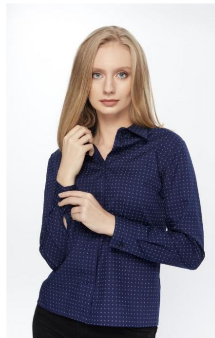
DARK BLUE LONG-SLEEVED BLOUSE