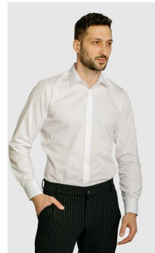
WHITE SLIM FITTED SHIRT WITH HIDDEN BUTTON PLACKET