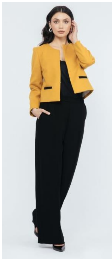
MUSTARD YELLOW, COLLARLESS OPEN JACKET AND BLACK PANTS