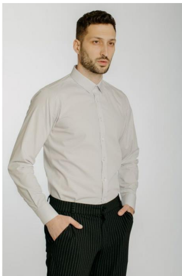
GREY, WIDE FITTED, COTTON SHIRT WITH ADJUSTABLE CUFFS