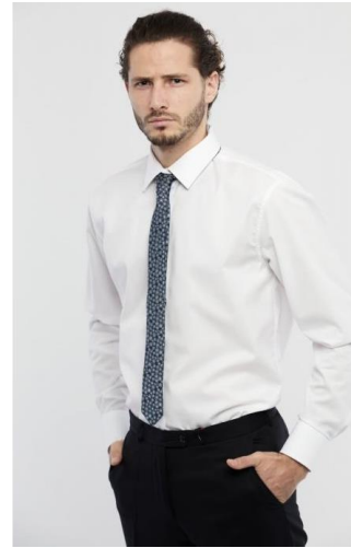
REGULAR FIT, WHITE PREMIUM COTTON SHIRT